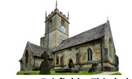
Hampton – Fairfield – Thistledown Eastwick Park – Charity Crescent